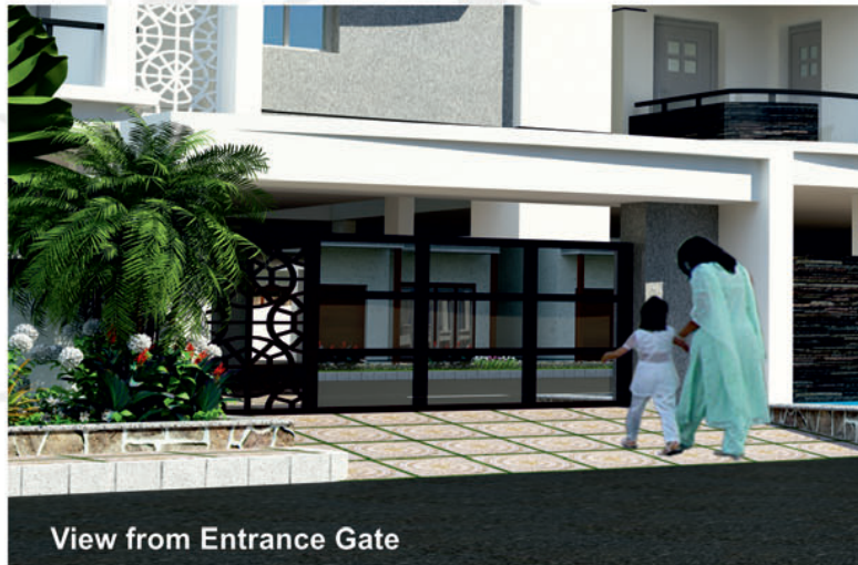
View from Entrance Gate

Fortune Iconia is the latest venture from Aaditri, the name behind many successful ventures. Guntur city is witnessing all round rapid infrastructure development with many opportunities for growth. Fortune Iconia is designed to be a secure residential abode that seeks to evoke and inspire the spirit of family living in the midst of nature. Fortune Iconia's well integrated apartments will have all modern facilities to ensure a comfortable lifestyle, with careful planning for maximum space with plenty of natural light and ventilation. It is close to shopping malls, star hotels, hospitals and entertainment with several reputed schools and colleges in the vicinity. Select your own flat and enjoy life like never before.